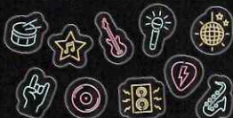
10 Player Tokens