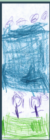
Callie Posillico Kindergarten