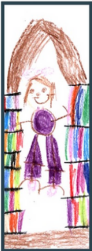
Camryn Lepore Kindergarten