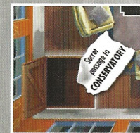
The lounge is connected to the conservatory.